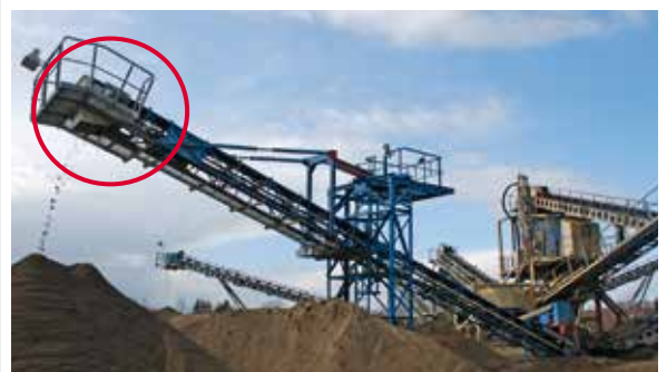
Conveyor model with 4 lubrication points